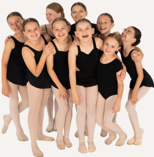
Photo week we get class photos as a group, individual photos of each dancer and one set of sibling/cousin photos for families that would like it. Special bookings can be made if families would like additional photos.

The week of April 24th-28th Students will arrive at their normal class time with hair and makeup ready for photos. Photo week is the dancers first look at what its like to get ready for their big show.